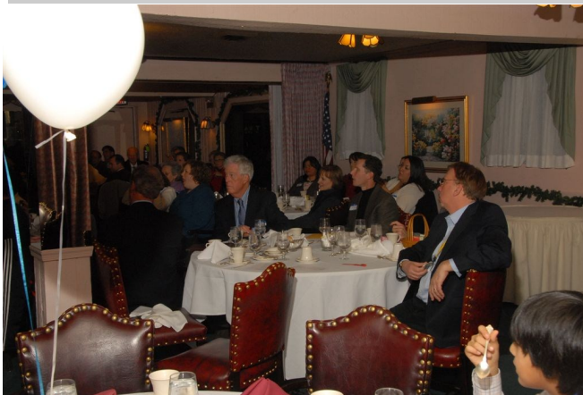
Club members eagerly look on as the contestants compete.

We have three winners from our Communications Contest for the Deaf and Hard of Hearing. Our winners are currently practicing for their next competition on Feb 23, 2013 at the District level for a $2500 scholarship. Each contestant presented a unique response to the topic "Why My Voice Is Important".